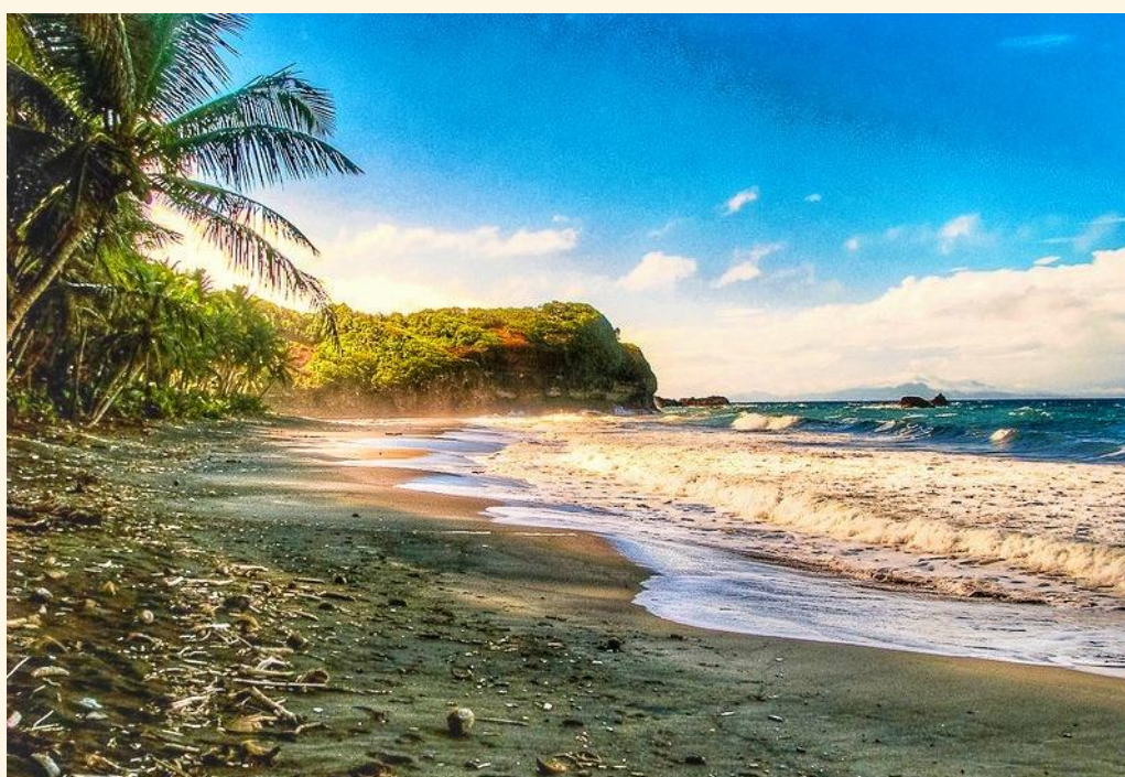
Number One Beach, where a scene from Pirates of Caribbean was filmed – under 20-minute drive from proposed site

DISCOVER DOMINICA: Provides hospitality and tourism certification, ensuring compliance with industry standards and enhancing the project's marketability.